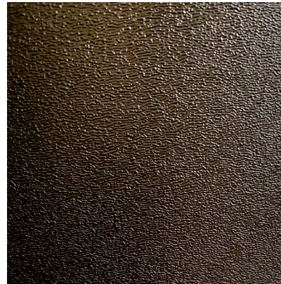
Black Textured Add "BLK" to item number