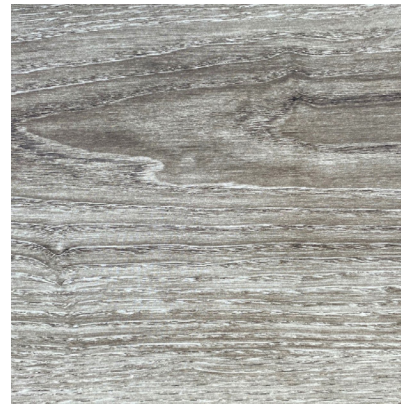
Gray Woodgrain Add "GRAY" to item number