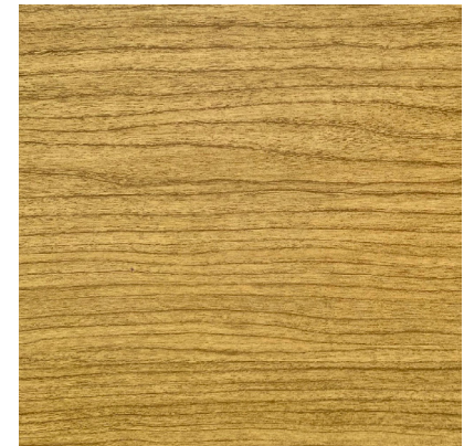
Bamboo Add "BB" to item number