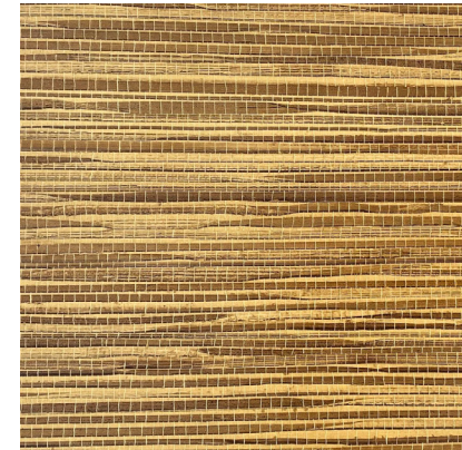
Weave Add "WE" to item number