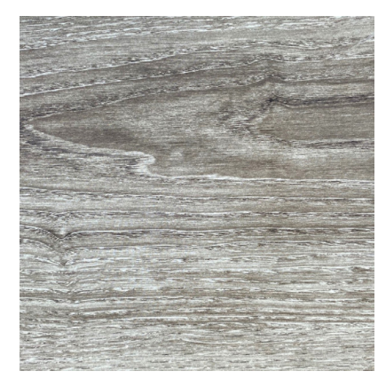
Gray Woodgrain Add "GRAY" to item number