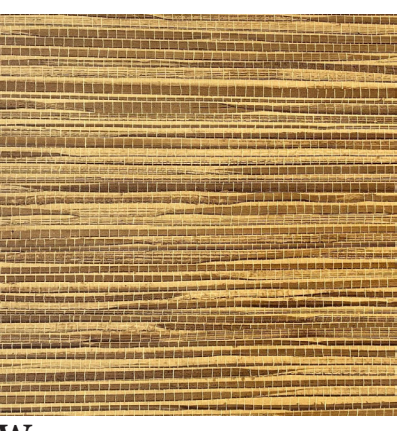
Weave Add "WE" to item number