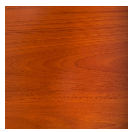
Yorkshire Cherry Add "YSC" to item number