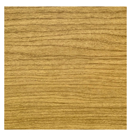
Bamboo Add "BB" to item number