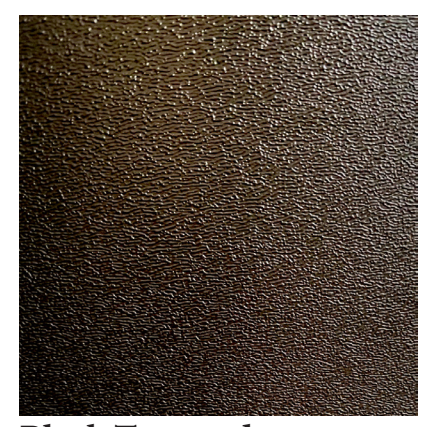
Black Textured Add "BLK" to item number